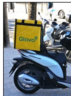
Figure 2 Glovo Box for Transporting Food and Other Products

The mobile app that Glovo developed specifically for the Glovers was a basic but very useful tool to help them operate properly. Glovers used it to receive and accept or reject new available orders but also for other purposes, such as choosing schedules, interacting with Glovo staff or